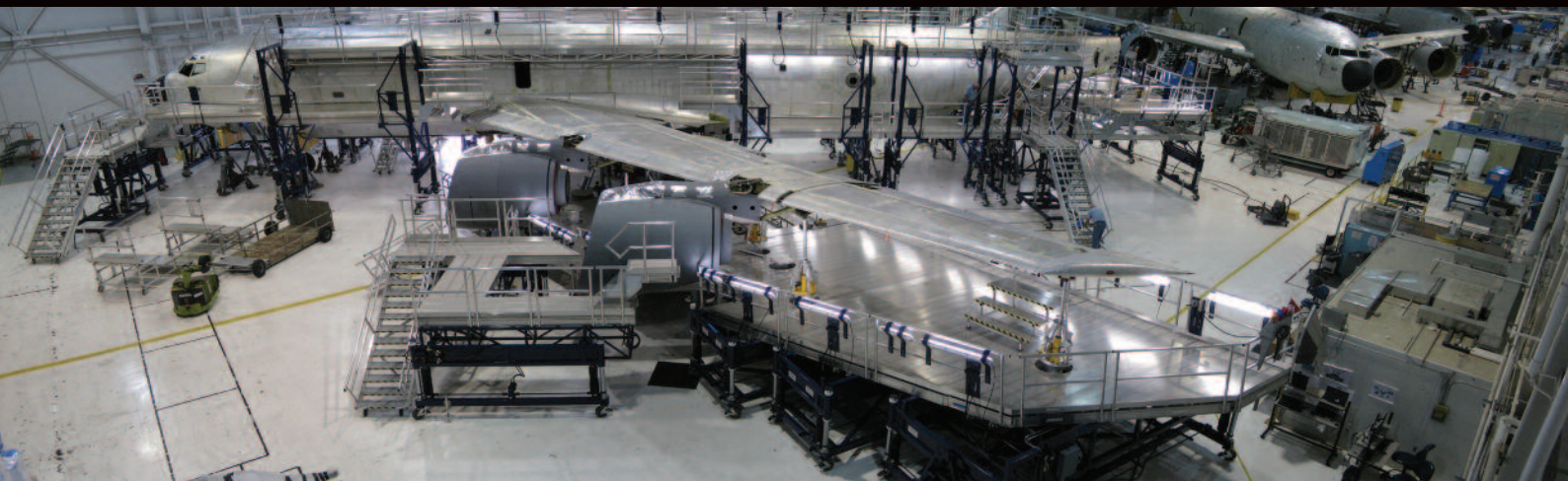
CUSTOM ACCESS SOLUTIONS

Maintenance Platforms and Docking Systems