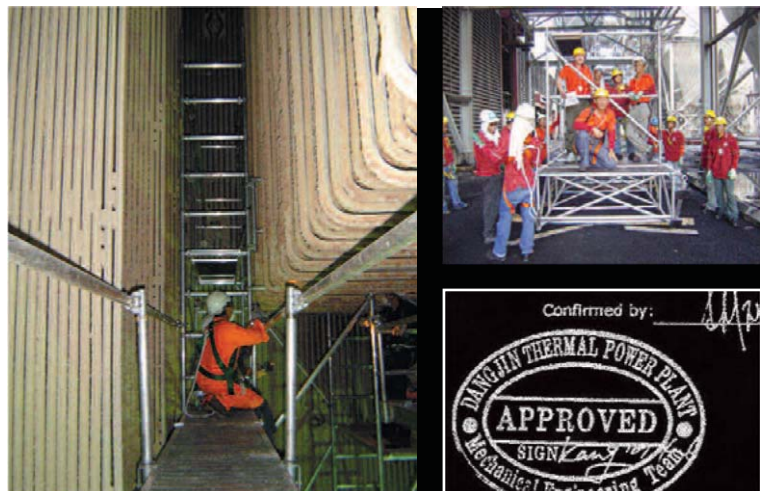
Above Left: Superheater Access Platform. Provides access for operators between superheater platforms